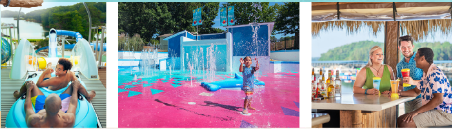
Fins Up Water Park boasts 18 attractions and multiple themed dining options.